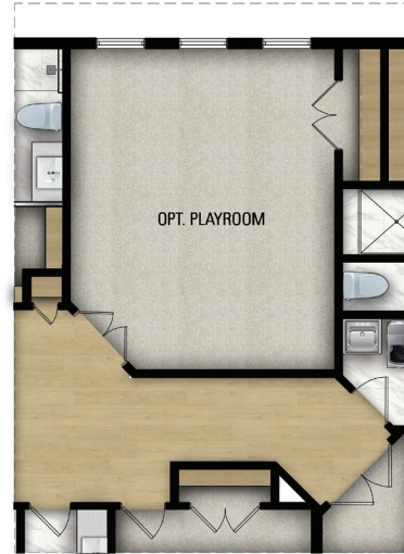
OPT. SECOND FLOOR PLAYROOM PARTIAL PLAN