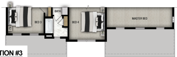
ELEVATION #3 PARTIAL PLAN