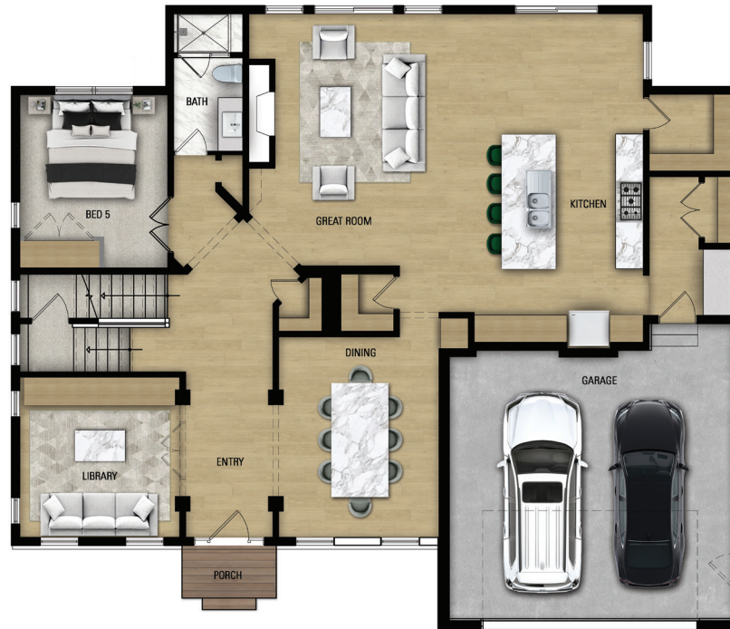
FIRST FLOOR PLAN ELEVATION #1