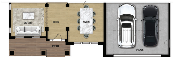
ELEVATION #2 PARTIAL PLAN