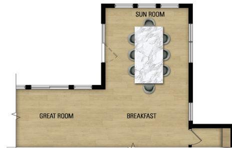
OPT. SUNROOM PARTIAL PLAN